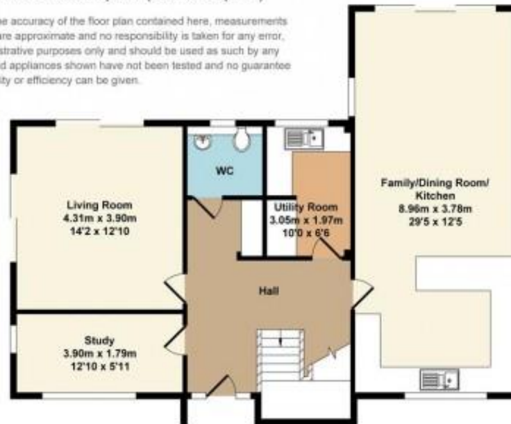
Ground Floor Approx. Floor Area 84.90 Sq.M. (914 Sq.Ft.)