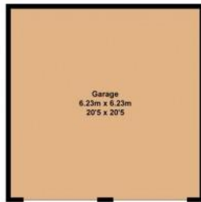
Garage Approx. Floor Area 38.80 Sq.M. (418 Sq.Ft.)

Whilst every attempt has been made to ensure the accuracy of the floor plan contained here, measurements of doors, windows, rooms and any other items are approximate and no responsibility is taken for any error, omission, or mis-statement. This plan is for illustrative purposes only and should be used as such by any prospective purchaser. The services, systems and appliances shown have not been tested and no guarantee as to their operability or efficiency can be given.