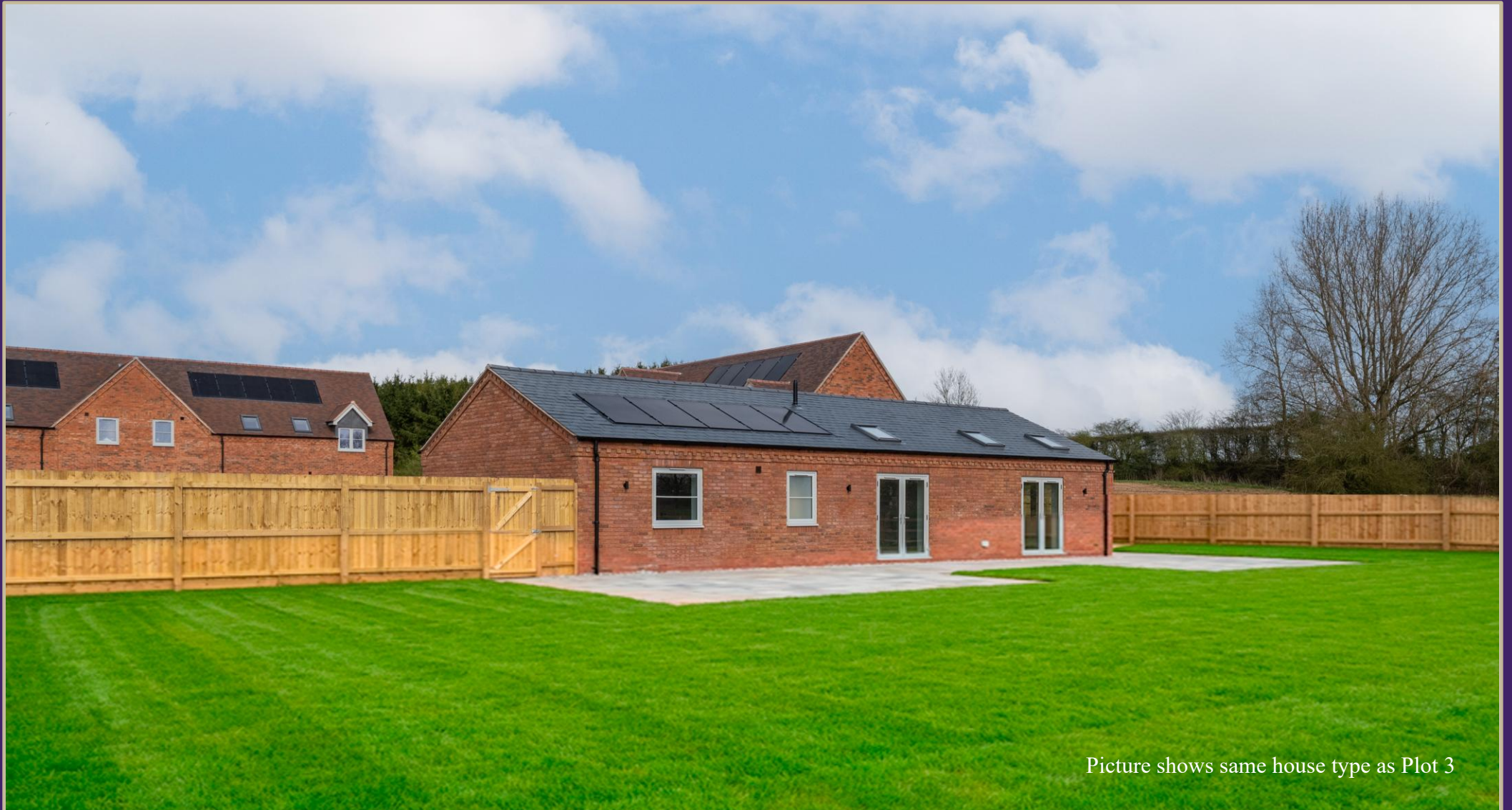
Picture shows same house type as Plot 3