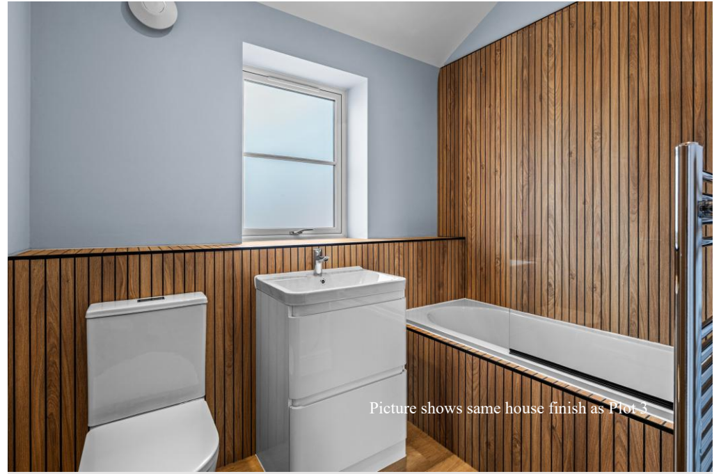
Picture shows same house finish as Plot 3