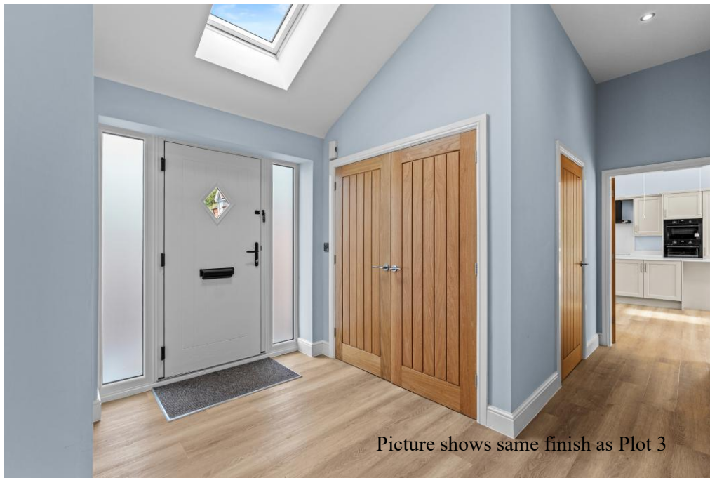
Picture shows same finish as Plot 3