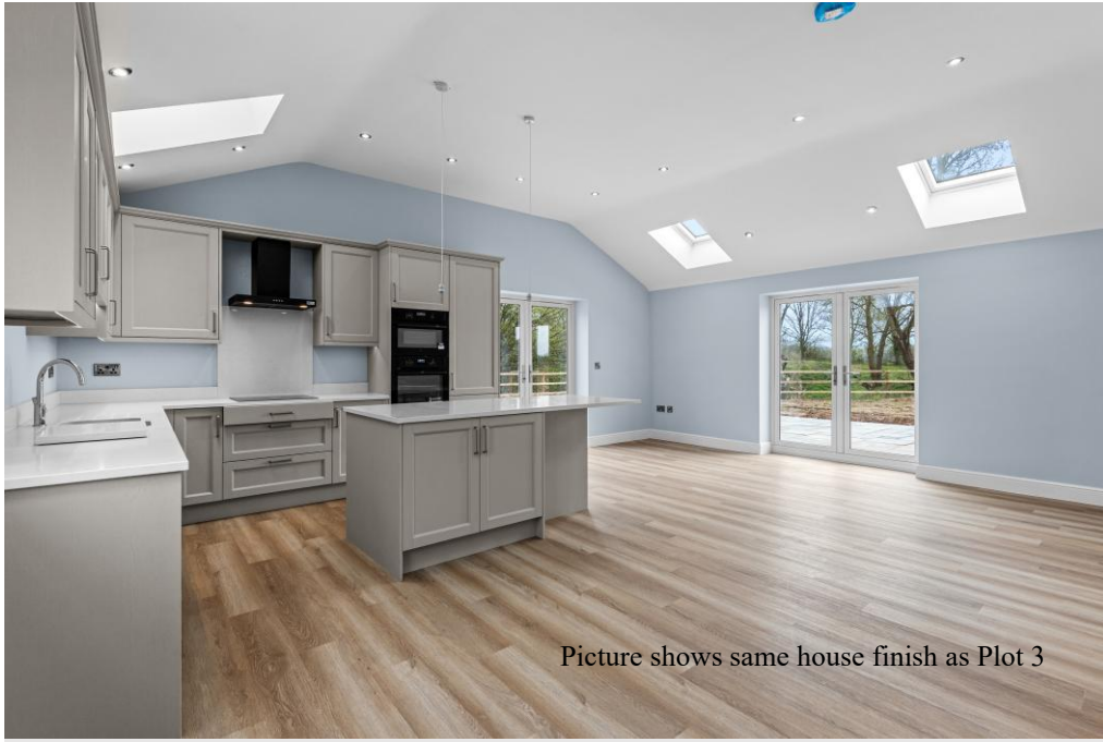
Picture shows same house finish as Plot 3