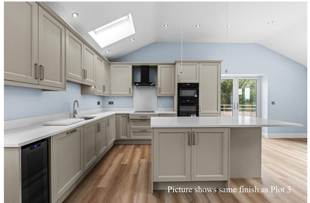
Picture shows same finish as Plot 3